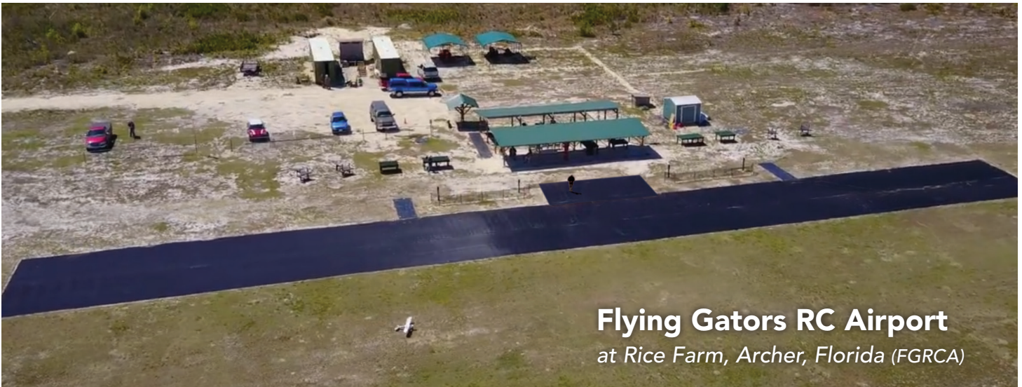
Flying Gators RC Airport at Rice Farm, Archer, Florida (FGRCA)

Enjoy access to one of the finest RC flying model facilities in Florida: